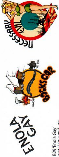
B29 'Enola Gay' 393rd BS 509th BG North Field, Tinian, 6th August 1945

Boeing B29 Superfortress. This decal set contains markings for three B29 bombers used for the war-ending Atom-Bomb Missions over mainland Japan. Enola Gay was tasked with the Hiroshima mission and dropped the first A-Bomb, nick-named 'Little boy', a large but conventional Atomic weapon looking like an over-sized 1000 pounder. 'Bocks Car' was used on the second and last attack, dropping it's bomb 'Fat-Man' on to Nagasaki. The other livery included in this set is of the lesser known camera plane 'Necessary Evil' which flew over with scientific personnel and camera operators to film the effects of the explosions to gauge their effectiveness providing the world with it's first and hopefully last images of the incredible destruction wrought by these devastating weapons.