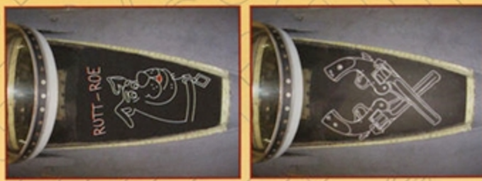
Rear Deck 87-0222

FS36270 Testors MM 1725 Humbrol 1*Hu:156 + 1*Hu:34 Gunze Sangyo H306 Xtracrylics XA1133